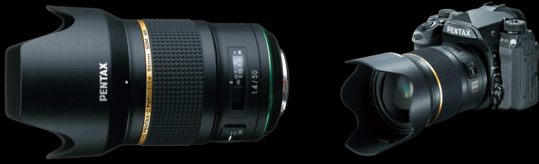
HD PENTAX-D FA* 50mm F1.4 SDM AW (Hood, lens cap, lens mount cap, and lens case included)