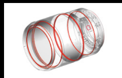
The positioning of special seals

Developed as an All Weather (AW) model, this lens features a dependable dustproof, weather-resistant structure with eight special seals to prevent the intrusion of water and dust into the lens interior. When paired with a PENTAX weather-resistant digital SLR camera body, it forms a durable, reliable digital imaging system that performs superbly in demanding outdoor shooting settings.